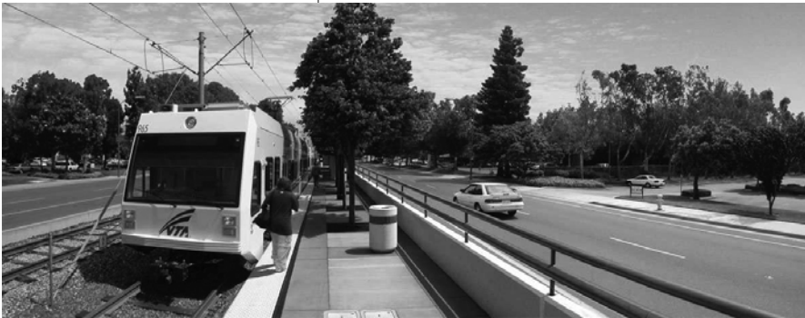
Above and Below: Images of North San Jose today and in its potential future.

The current Policy was adopted by the City in 1988 as part of a collaborative effort with Milpitas, Sunnyvale, Mountain View, Palo Alto and Santa Clara County