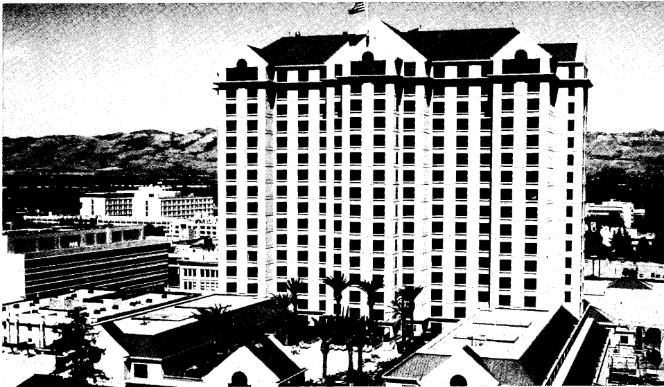
Conference Headquarters San Jose's Fairmont Hotel

The theme: "Pacific Rim, the Economy, the Environment, and the People." The participants: California, plus the Western States, and a number of the 26 countries located around the rim of the Pacific Ocean. The location: Fairmont Hotel in San Jose—a new hotel in a reborn downtown situated in the heart of Silicon Valley.