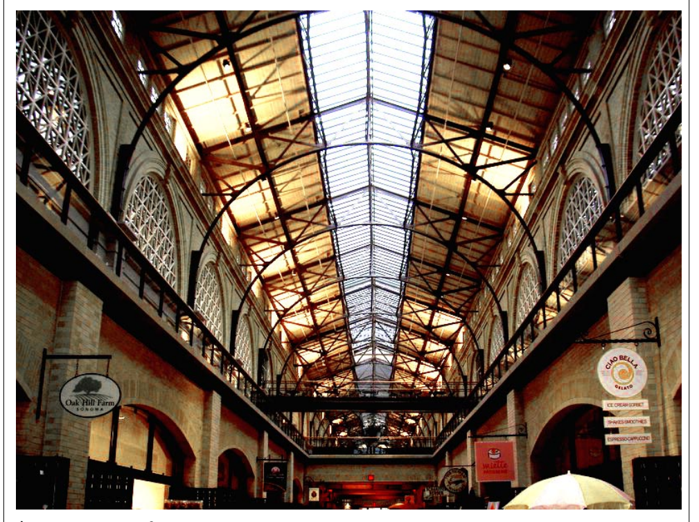
Answer on page 6