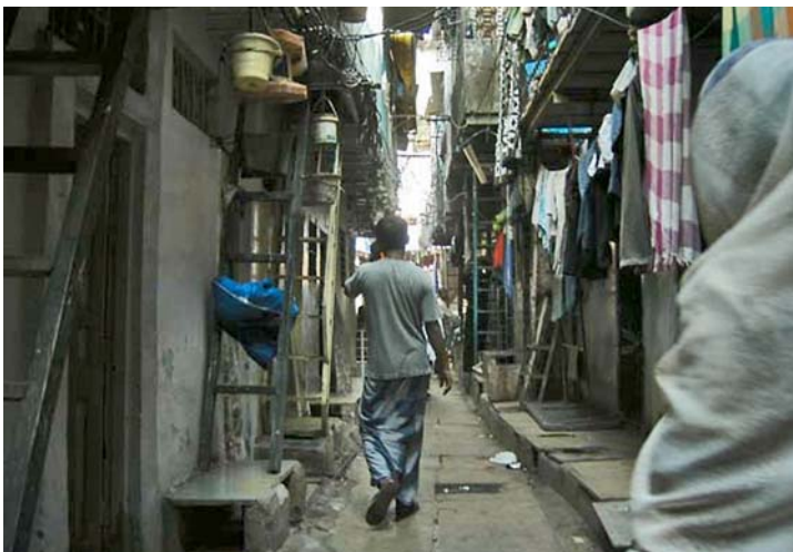
Dharavi, Kuti Wadi.