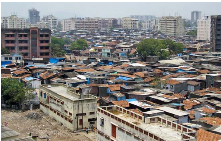
Dharavi, general view.