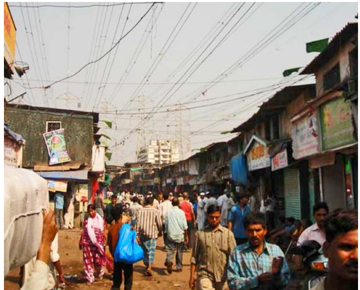
Dharavi, high tension lines above main street in Social Nagar (Neighborhood).