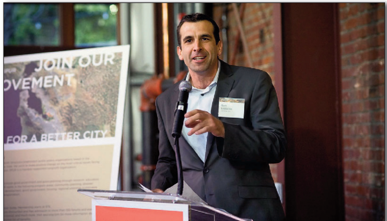
San Jose Councilmember Sam Liccardo spoke about San Jose history and future.