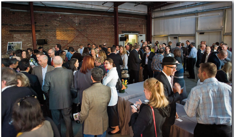
More than 500 people attended the festive launch party. They were served wine and sushi hors d'oeuvres while crowd surfing.