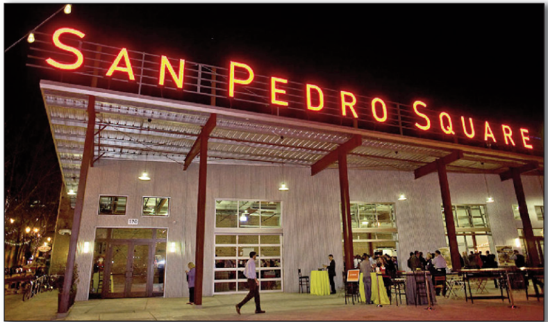
San Pedro Square, downtown San Jose, was a great blend of outdoor and indoor space for this event.