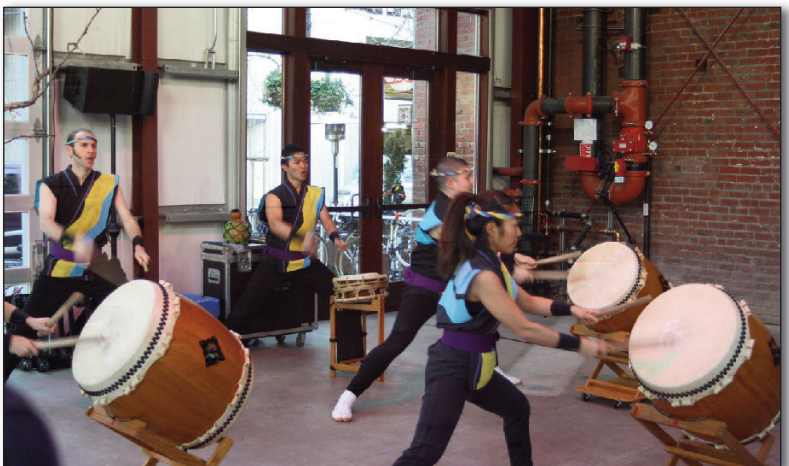
The San Jose Taiko Drummers perform at the beginning of the party.