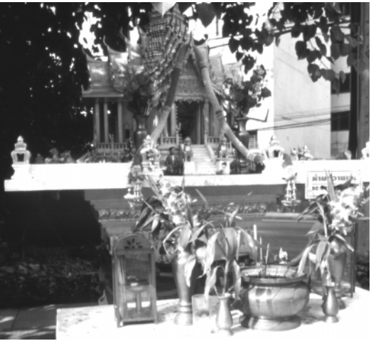
* Spirit houses are miniature traditional Thai houses, supplied with figurines and edible offerings. They invite protective spirits to reside on the premises.

Through the tropical heat, noise, and apparent lack of pattern to the city, themes begin to emerge. Thailand's largest minority is Chinese and there is a distinct Chinatown with restaurants and red and gold temples. Elsewhere in the city are market areas devoted entirely to the sale of electronics or software. There is a cloth market, crowds of shoppers sorting through endless bolts of fabric, and neighborhoods of open-fronted shops all selling the same thing, such as auto tires or statuary. Unfortunately, prostitution defines one or two neighborhoods, a fact that