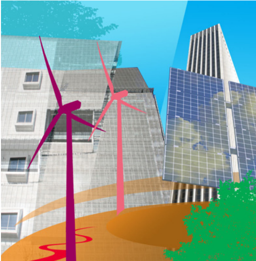
Original graphic by Lutzka Zivny ©2007

“Bicing,” a successful bicycle rental service that the City of Barcelona implemented, is becoming popular through much of Europe ( www.bicing.com —the site is in Catalan and Castilian Spanish). The service functions much like car-sharing. Once you register with Bicing and activate your swipe card, you can use any one of Bicing’s 1,500 bikes. The first half-hour of every trip is free, and you can return your bike to any Bicing location around the city. Every half-hour over the initial free half-hour costs 30 eurocents, making Bicing the cheapest public transport system in Barcelona. You can keep any one bike for up to two hours, and you can always return a bike, run your errand, and grab another for no additional charge. A local program could make bikes available for rent at major (or all) Bay Area transit stops so that transit riders could wheel themselves to their final destinations.