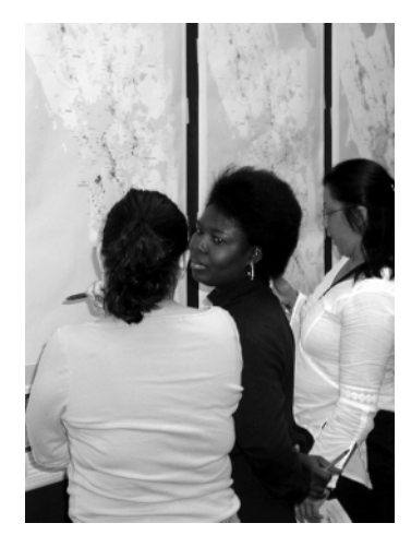
Attendees look at regional growth