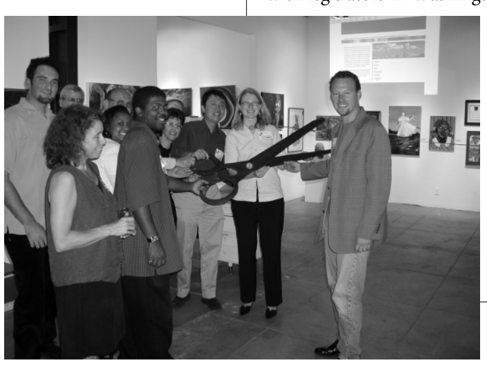
APA Board cutting the virtual ribbon to the new web site.