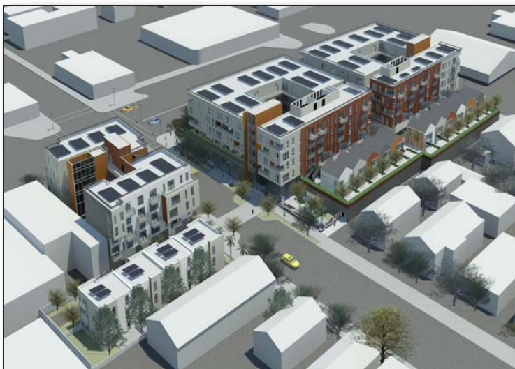
Proposed development, overhead perspective from North