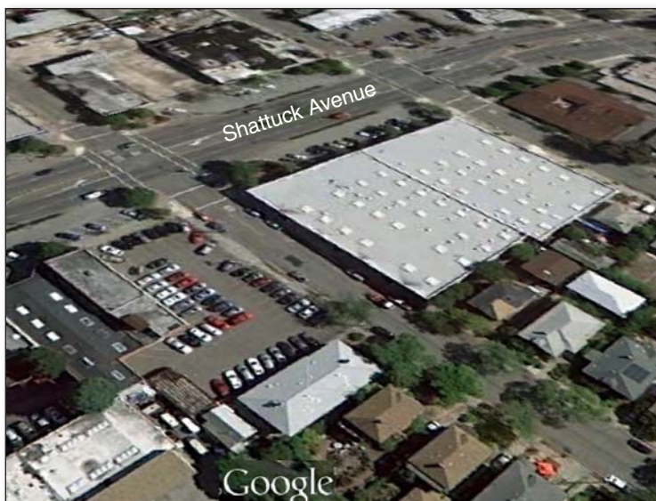
Existing site, aerial view from North (screen capture from Google Earth)

Berkeley's development review process is notorious. Yet Parker Place was entitled in less than 16 months, a record for a project of its size in Berkeley. Even so, the project was the subject of nine noticed public hearings before the Design Review Committee, Landmarks Preservation Commission, and Zoning Adjustments Board. Citycentric voluntarily held more than a dozen meetings in living rooms in the project neighborhood.