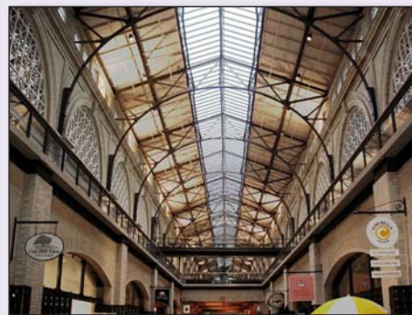
Ferry Building Nave.

The American Planning Association has designated San Francisco’s Ferry Building as one of 10 Great Public Spaces for 2010 under APA’s Great Places in America program. Since beginning the program in 2007, APA has designated 40 neighborhoods, 40 streets, and 30 public spaces in 47 states and the District of Columbia. In Northern California, North Beach in San Francisco was designated a Great Neighborhood in 2007.