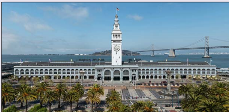
Ferry Building, May 27, 2008.

The American Planning Association has designated San Francisco’s Ferry Building as one of 10 Great Public Spaces for 2010 under APA’s Great Places in America program. Since beginning the program in 2007, APA has designated 40 neighborhoods, 40 streets, and 30 public spaces in 47 states and the District of Columbia. In Northern California, North Beach in San Francisco was designated a Great Neighborhood in 2007.