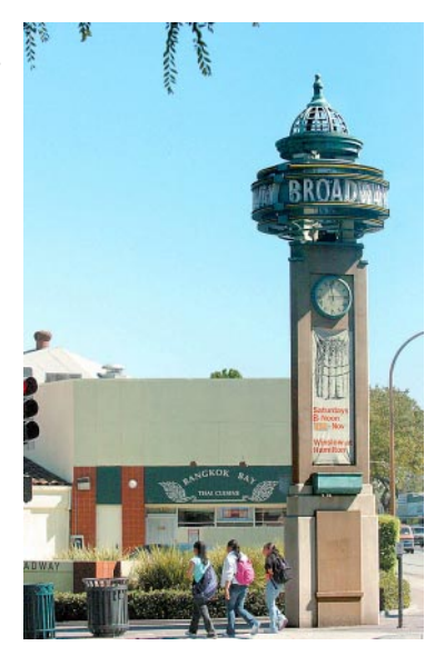
Clocktower, Redwood City