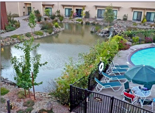
Gaia Napa Valley Hotel grounds, American Canyon

services manager at PMC, provided an ad-hoc tour of the green features of the hotel. They include water efficient landscaping, storm water collection,