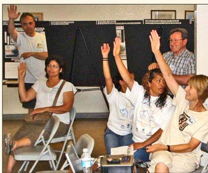
A CommUniverCity bilingual workshop