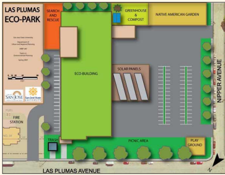
Master plan, San José Urban Eco Park