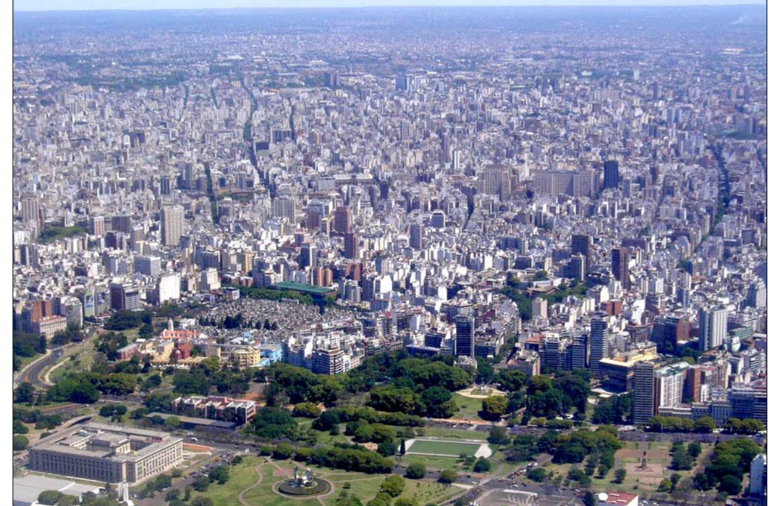
Answer on page 6