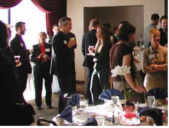
APA Northern Section Members and Guests chat and eniov the view from the Top of the Bay Banquet Room of the Bay Bridge Holiday Inn Hotel.