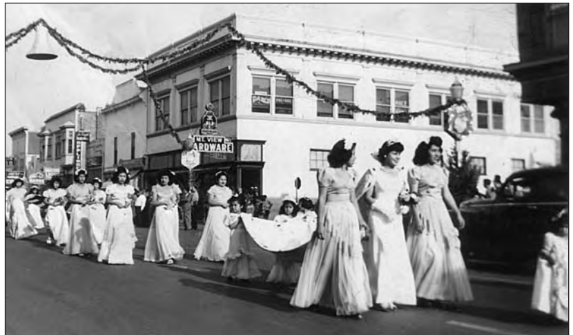
Mexican-American procession, downtown Mountain View, c. 1950

Nick's conceptual plan for a new mixed-use neighborhood is timely, as pressure to redevelop