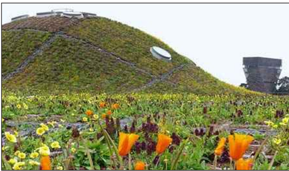
Living roof, California Academy of Sciences, San Francisco.