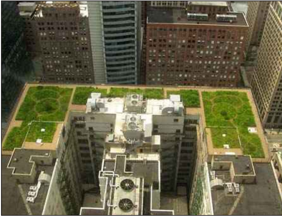
Chicago City Hall got its green roof in 2001.