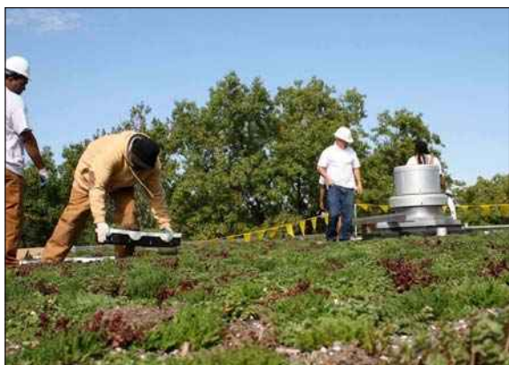
Installing pre-planted trays simplifies installation and maintenance. Shown here: a Green Jobs Now event in 2008 that installed a 1,000 sq. ft. green roof atop a dormitory. Co-hosted by SmartRoofs, LLC (a subsidiary of Sustainable South Bronx) and Sarah Lawrence College.

Leaks. There is some concern that covering a roof with vegetation will make it impossible to locate and repair leaks; this is not true. Leaks on any rooftop usually appear at joints and slab penetrations. Careful attention to the design detailing and inspection during any roof installation will greatly minimize the potential for leaks. Key recommendations include: design the flashings to terminate 8 inches above the green roof surface, slope the subslab at least 2 percent, and provide redundant surface drains in case one or more clog. In addition, permanent leak detection systems can be installed with the roof membrane, or Electric Field Vector Mapping can be utilized after construction to quickly locate a leak. Green roofs are often designed with modular planting systems to simplify the removal of substrate and plants for roof repairs.