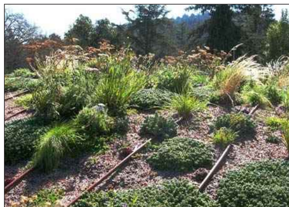
In-line drip emitter lines irrigate this extensive green roof atop the new dining facility at the 2006 award-winning Presentation Center , Los Gatos, California.

Maintenance. Green roofs can be designed to minimize the need for maintenance and to allow easy access to the rooftop. Expectations, appearance, and ease of maintenance must be considered at the outset to ensure a proper match between design intent and ongoing care.