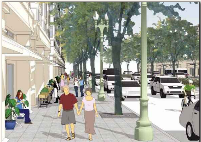
Grand Boulevard. Basic option for building frontage in high-activity nodes along El Camino Real.

Commission (MTC). In addition, the District received a federal earmark for the GBI and awarded $2 million in grant funding to cities for five improvement projects that conform to the GBI vision. The Progress Report , published in early 2009, showed an increase of ongoing projects and plans on the corridor from 20 in 2007 to over 100 in 2009. In 2009, the GBI hosted the highly successful public forum, called "New Realities, New Choices: A public forum on transforming the El Camino Real Corridor". The forum educated approximately 275 attendees (ranging from the general public and community members to planners, elected officials, and agency staff) on the planning efforts underway in the El Camino Real corridor, planning successes throughout the world, and lessons learned from those successes. Details of the activities and documents developed or collected by GBI are available at http://www.grandboulevard.net/ .