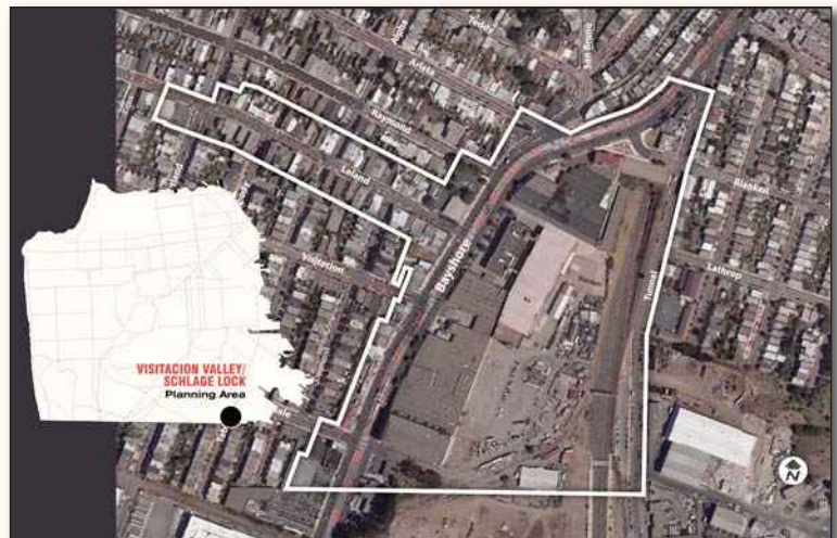
Visitacion Valley planning area ■

The Design for Development is a model for how other infill developments can be realized by working closely and transparently with the community to create a vision, then implementing this vision with a specific, usable regulatory plan. The form-based design document proscribes critical pieces of the physical design of the project area but also provides the flexibility for building types, block-by-block density, and grocery store locations to adjust to market conditions. The site is currently undergoing clean-up and construction is expected to begin in 2011.