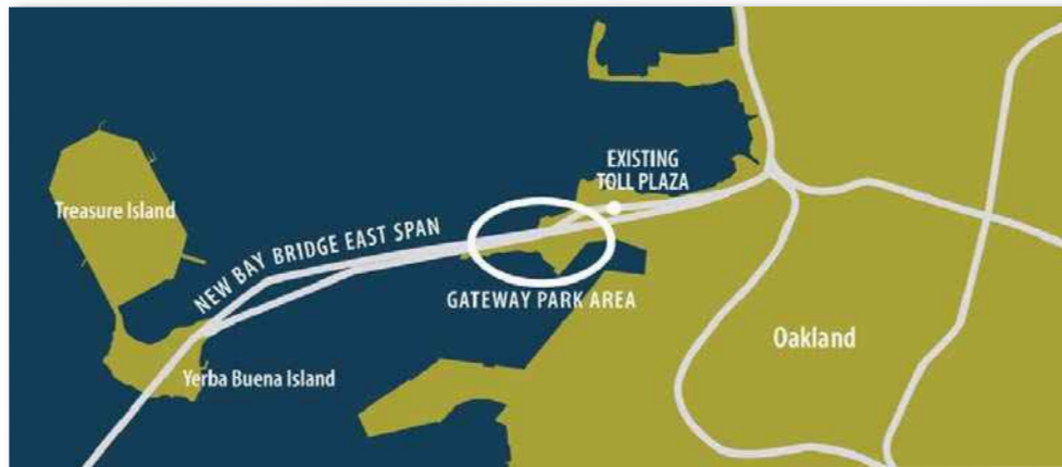
Gateway Park Location Map

Over 10 years ago, the Bay Bridge design team identified a unique opportunity to create a gateway park to Oakland and the East Bay and offer an unprecedented way to experience the Bay and the new bridge. The new Bay Bridge East Span, currently under construction, will offer a spectacular bicycle and pedestrian experience, connecting Oakland to Yerba Buena Island. Gateway Park will be a starting point for that journey.