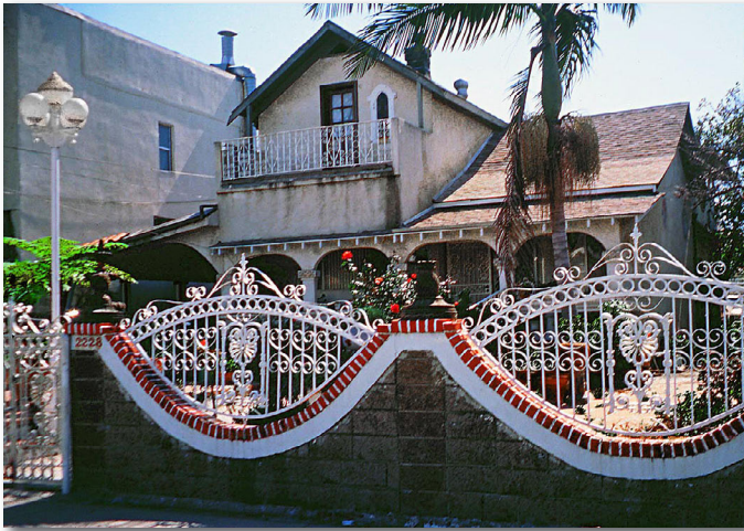
An elaborate wall plus fence establishes a new threshold and a defensible yard.

Visitors rarely cross the threshold of a home unless invited to do so. And inviting or not inviting someone to enter the home is a clear signal of the occupant's desire for more contact or less. One can design the threshold to visually keep visitors at bay, not inviting them to cross the threshold.