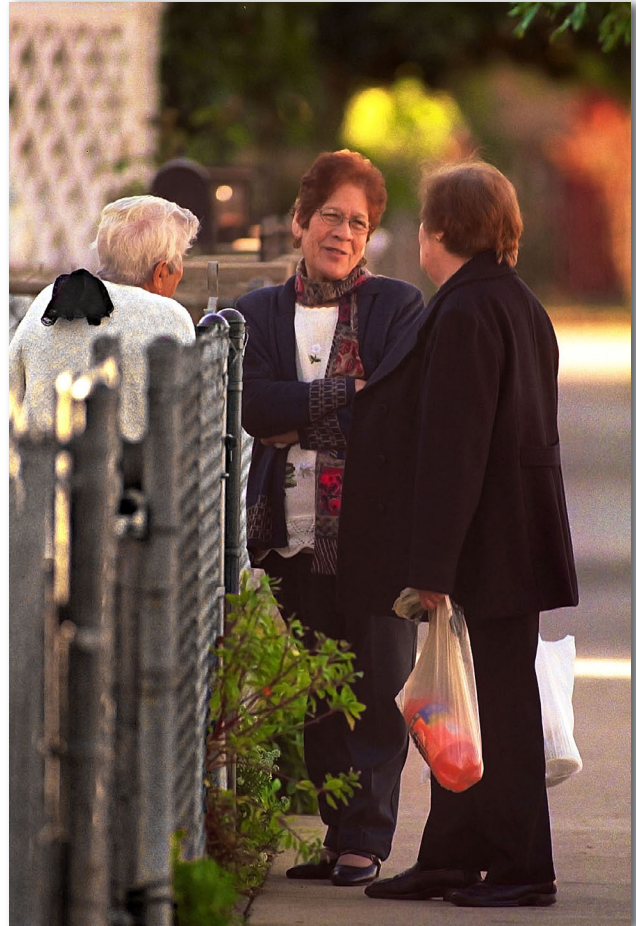
The front fence offers a place to chat.

While it's true that many Latino homeowners also build fences to protect their homes, keep neighbors pets off their