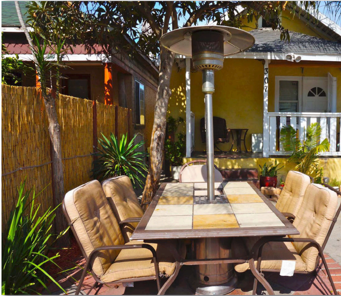
An enclosed front yard is an extension of the house. The porch appears to be an addition.

have altered the general physical characteristics of the neighborhoods and the residents' behavior patterns. The continuous green, park-like setting that symbolized the American suburban front yard has been cut into individual slices in East Los Angeles. These "slices" readily allow for individuality and sociability and create diversity.