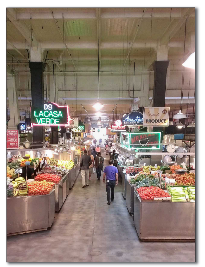
Grand Central Market, in the Homer Laughlin Building, downtown Los Angeles, 2014.

"Now Grand Central offers a window into a different, unlikelier chapter of the city's evolution: the downtown throngs richer, hipper, and hungrier for things locally sourced and sustainably farmed. The market is not a sterile facsimile; it has not been airbrushed like San Francisco's Ferry Building or 'mallified' like Boston's Faneuil Hall. But its rediscovery speaks to the collision of commerce and community throughout central L.A. — cultural tug-of-wars that have jostled neighborhoods from Silver Lake to Highland Park to Boyle Heights which is why Grand Central's transformation continues to be both cheered and scrutinized, mimicked and lamented, and in a courthouse just blocks away, litigated."