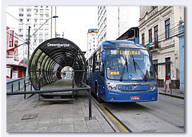
BRT in Curitiba, Brazil.

International experience also benefits the profession at large. It exposes planning students and professionals to a much richer palette of planning practice and is one of the quickest paths to innovative ideas. Promising planning practices may be gleaned from close observation in other countries, carefully adapted, and transferred to meet local needs. Bus rapid transit — pioneered in Curitiba, Brazil — is an excellent example of an innovative transportation practice now widely adopted in the United States and around the world.