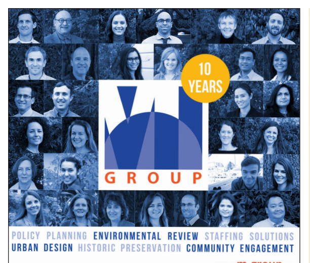
www. m-group .us