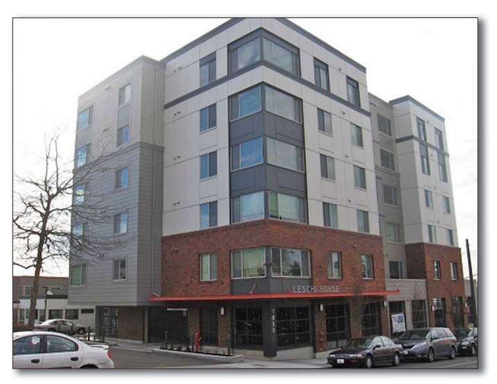
Leschi House was recently renovated and expanded to provide 69 affordable units for seniors and includes accessibility features for residents to age-in-place.

Leschi House, an affordable housing development in Seattle's Chinatown-International District, opened in March 2015 after a full renovation and expansion. The owner of the property, Seattle Housing Authority (SHA), doubled the number of units while also improving energy efficiency and accessibility, furthering the property's original goals of promoting independent living and building community for low-income seniors. Leschi House residents, most of whom are of Asian descent, can comfortably age in place, benefiting from the cultural opportunities in the predominantly Asian neighborhood and the walking and transit connections to Seattle's other amenities.