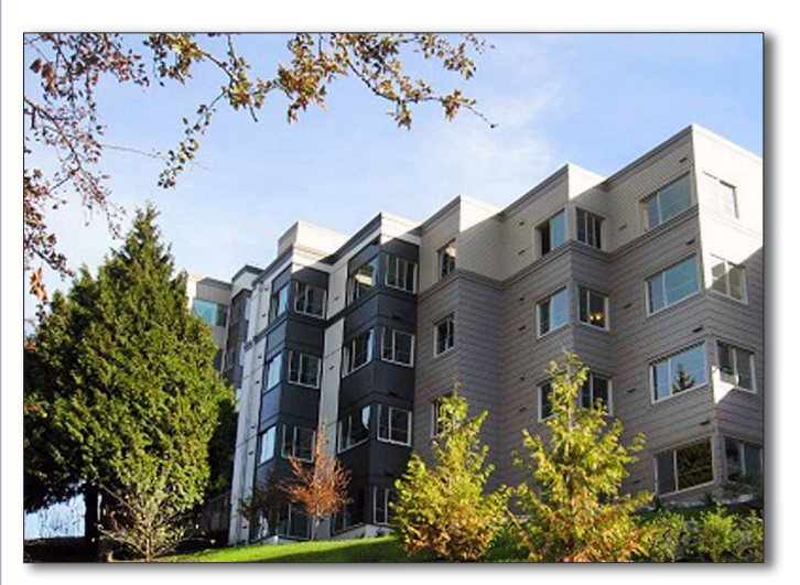
Residents can stay connected to their heritage because of Leschi House's location in the Chinatown-International District.

To promote independent living, the renovation retained the original building's accessibility features, including no-step entries and wide doorways and hallways, and updated the community room and community kitchen to meet Uniform Federal Accessibility Standards, http://bit.ly/2cspwfM. The new building includes four units and common areas that comply with the Americans with Disabilities Act, and an additional elevator that serves residents of both buildings. To further support residents' independence, SHA provides a case manager who helps create a sense of community among residents and connects them to services in the neighborhood and the city, such as Seattle's Aging and Disability Services Office, Full Life Care, and Providence Health and Services.