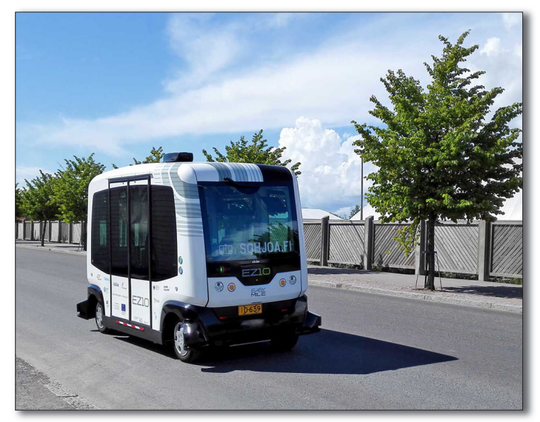
EasyMile EZ-10 automated bus.

"Self-driving vehicle trials are also set to go ahead on public roads of the UK, including automated lorries on the M6 (http://bit.ly/2canDBe) and small public transport pods (http://bit.ly/2camWYJ) in London."