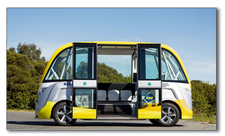
Navya RAC Intellibus.

"The trial is the first for the driverless bus in Australia, but before shuttles become common on Australian roads, a number of changes would need to be made to the road network to accommodate the cars, and legislation would have to be amended to remove the responsibility on a driver to be in control of a vehicle."