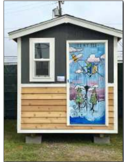
96-square-foot house, Licton Springs Village, Seattle.