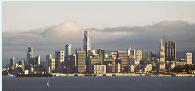
Salesforce tower and San Francisco skyline, looking south from Point Richmond.