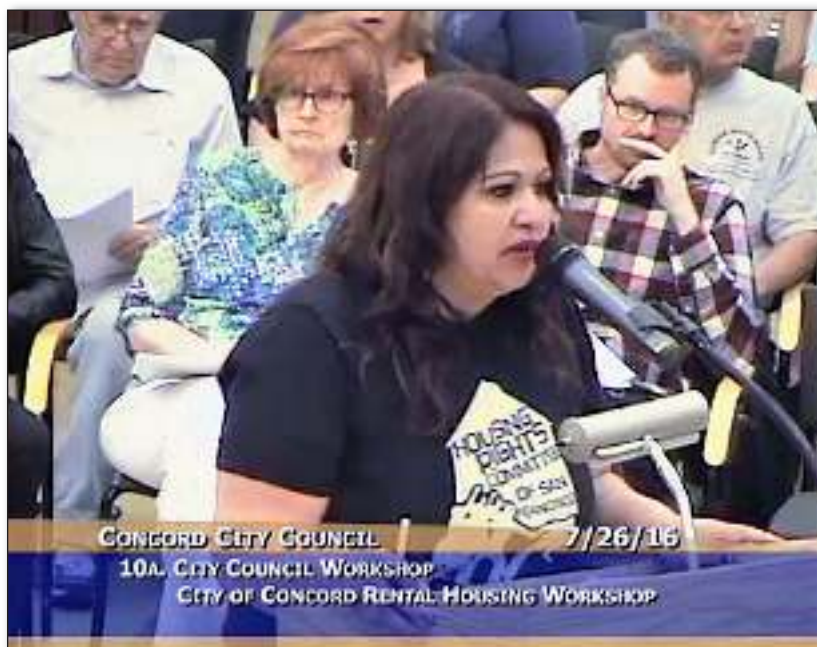
Screen capture of person testifying at a public hearing on rent control.

Concord’s program relies on non-binding mediation between tenants and landlords to avoid steep rent increases. Unlike rent control, which sets strict legal limits on annual rent hikes, the landlords can raise the rent as they wish. However, if the increase exceeds 10 percent in a 12-month period, the tenant is entitled to request professional mediation services to negotiate a more moderate increase. The landlord is obligated to participate in mediation,