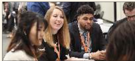
New planners at NPC17.

Student membership is now free for any full- or part-time student actively matriculated in any university or college degree program for the