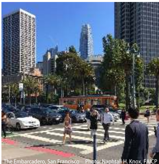
The Embarcadero, San Francisco