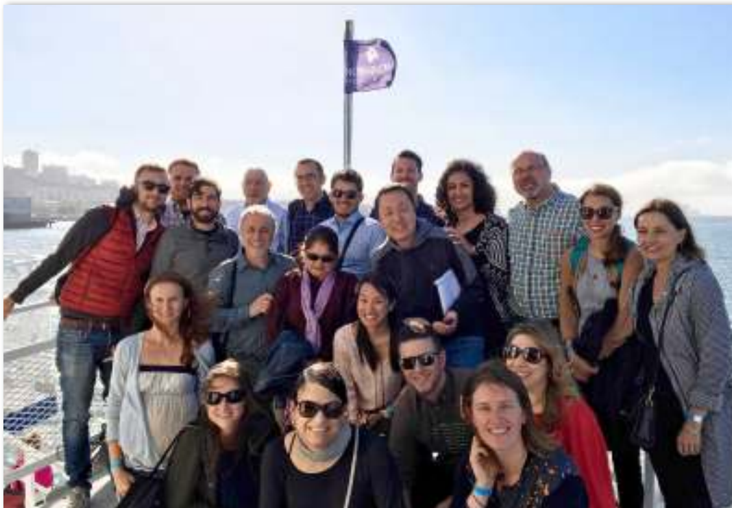
Northern Section Board members aboard the Hornblower Empress on July 13 take time out from networking.

Board directory and editorial information. Page 24 ■