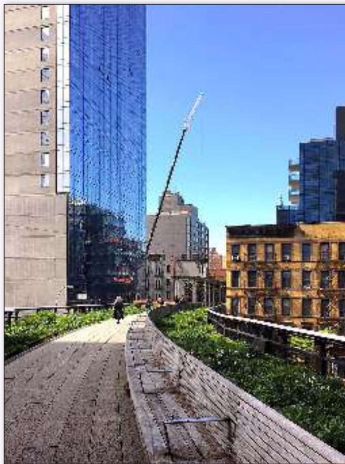
Richard Florida to PBS' economics reporter Paul Solman: "And there's one of the old buildings, still with the rainbow flag."

we choose to invest in public spaces (and in which ones), but also whether and how we can mitigate potentially damaging impacts.