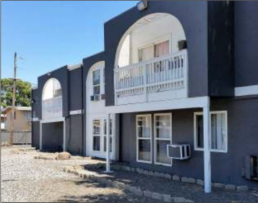
Rents at this Concord apartment complex jumped 34 percent in 2016 and tenants demanded action from the city.

Another important aspect of rent review is that it includes a peer review process for landlords. In Concord, some of the most problematic rent increases occurred when investors purchased buildings occupied by long-term tenants and quickly raised the rents to market rates. Peer review provides a means for more seasoned landlords and property managers to offer advice to new landlords on how to recover investment costs and work with tenants more effectively. This might mean phasing in rent increases over a few years instead of a few months, providing tenants with longer rent increase notice periods, and working with tenants to determine alternatives that might avoid displacement.